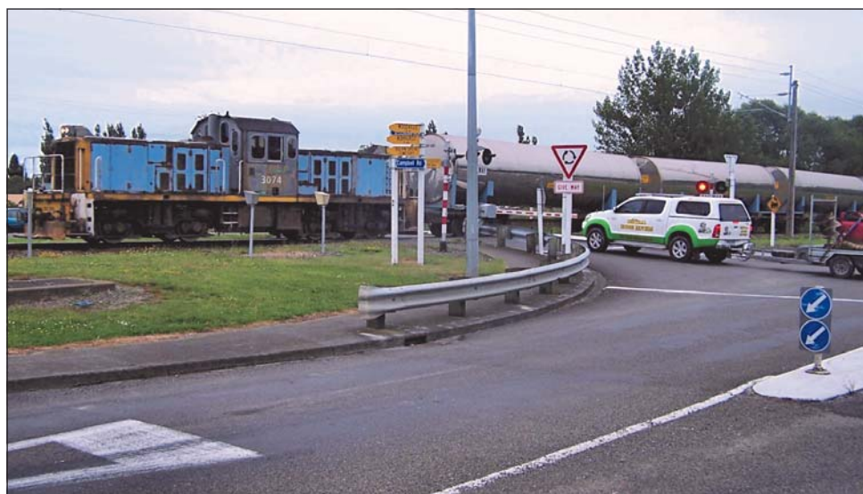
A RAIL crossing in the centre of Bunnythorpe provides another element to the existing traffic issues in the town.