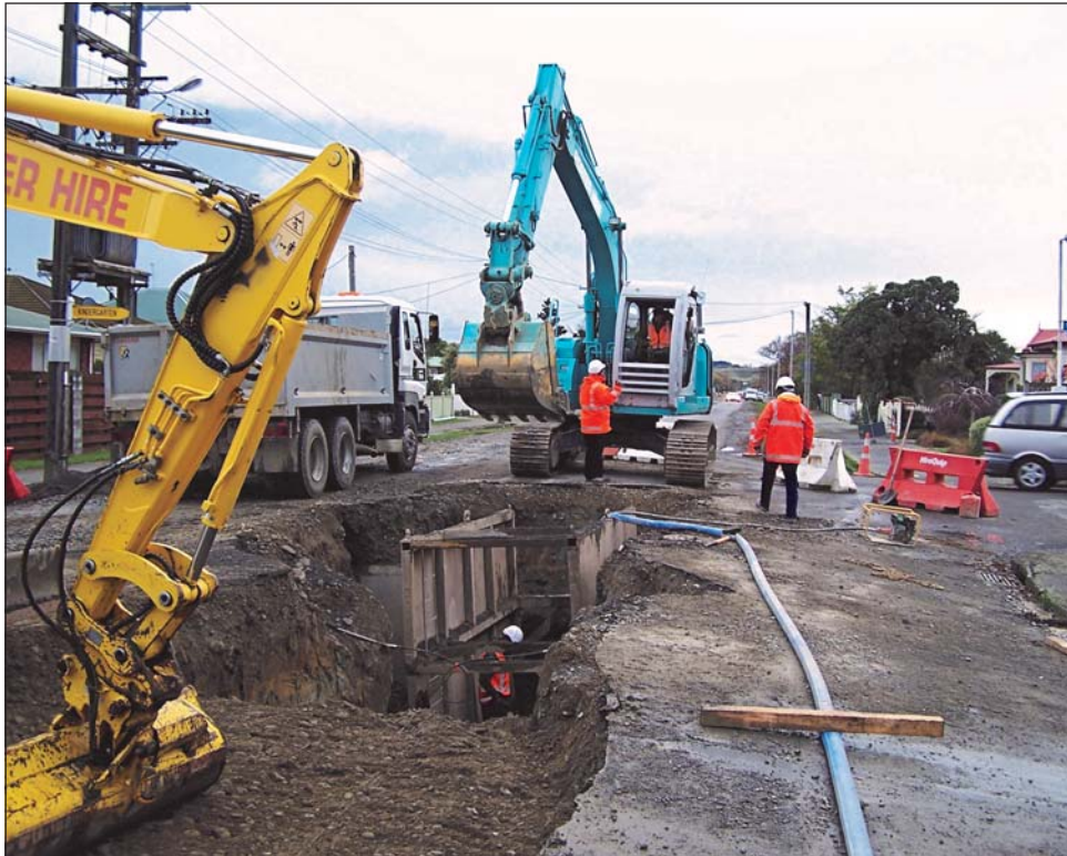
CONTRACTORS install the main trunk sewer down Denbigh Street near Montgomery Street.

WORK is progressing steadily on the $1.2 million reconstruction project in Denbigh Street, Feilding. The trunk sewer will cater for growth in the north-eastern part of Feilding as the existing connection was determined to be under capacity for predicted growth. "We've had a few wet days causing some delays but that's par for the course on projects of this type," said Mr Clifford. "We want to get it done and dusted as quickly as possible and it appears at this stage that we will finish on time in late November-mid December." He said as the contractors continued down the street installing the pipe work, another crew may start on preparations for street lighting and telecom cabling. It would also remove the existing pavement material and lower the road's crown to a new design level. New kerb and channelling, driveway crossings and footpaths would also be constructed while the existing grass verges are to be reinstated to a similar width, but with a new interlocking, plastic mesh material suitable for grass growth and car parking. Mr Clifford said there had been good co-operation between street residents and the contractors during the project, with few disruptions regarding vehicle access to private properties.